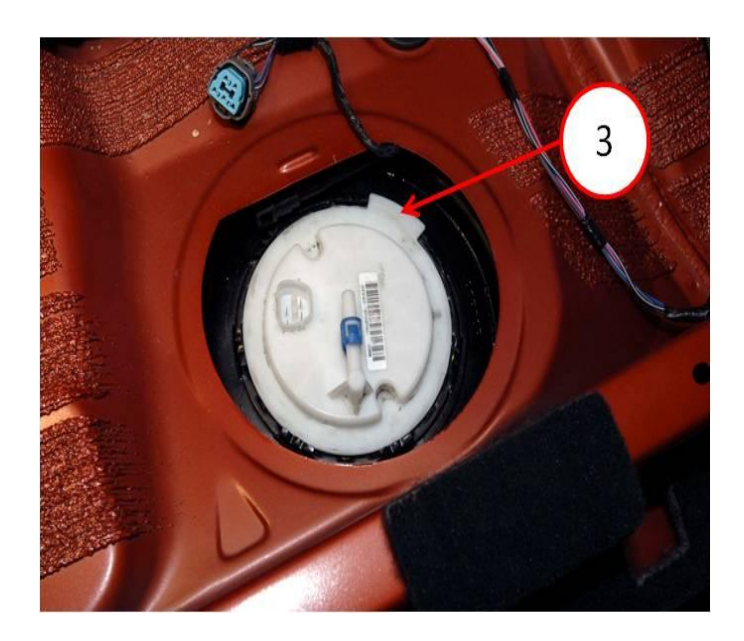
Fig. 2 Tab Location Installation

3 - TAB LOCATED AT THE 2 O'CLOCK POSITION