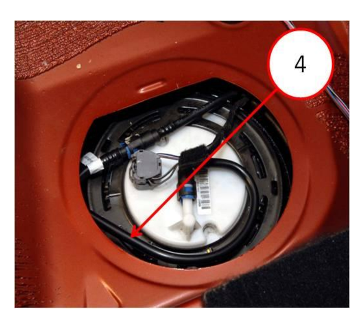
Fig. 3 Fuel Line Jumper