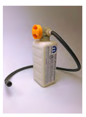
Tire Service Kit 05181361AE