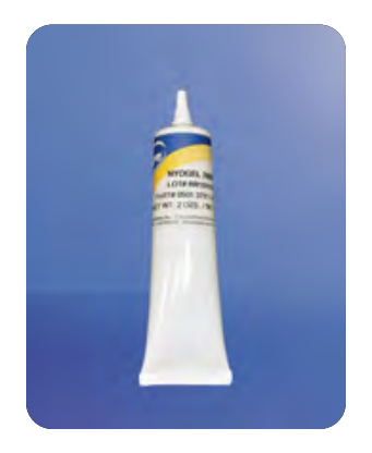
NYE® DIELECTRIC GREASE